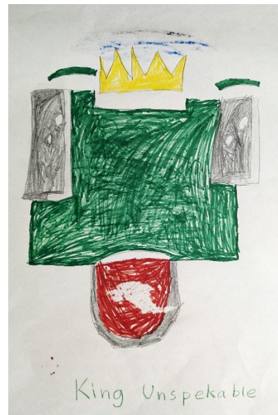
Sketch: Anurag Bag (Tutul)

You are the Majestic Magnolia Grandiflora.